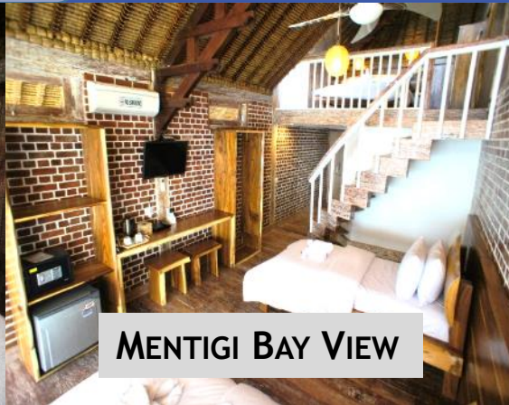
MENTIGI BAY VIEW