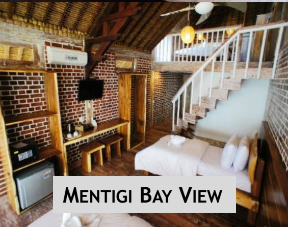
MENTIGI BAY VIEW